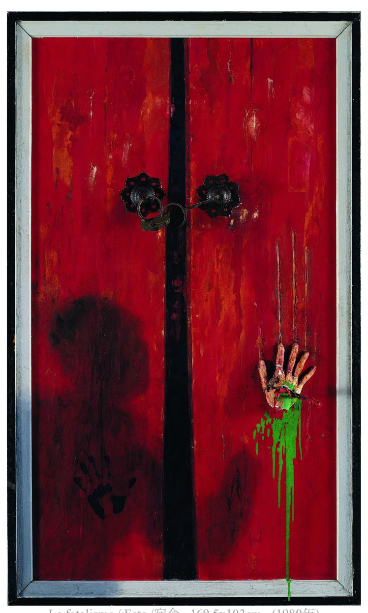
Le fatalisme / Fate /宿命 169.5x103cm (1980年)

所以在我看來傅慶豊先生不僅僅是一個創作具體作品的藝術家而是一個具有更大 視野和更寬廣訴求的文化游牧者!他一直都不主張搞殿堂、書齋和畫室裡的藝術,作 品似乎更不應該局限在畫布上和畫框裡,他一直希望自己能夠為他所摯愛的藝術與生 活之間打開一條通道,讓藝術走下聖殿,讓人們走進藝術。