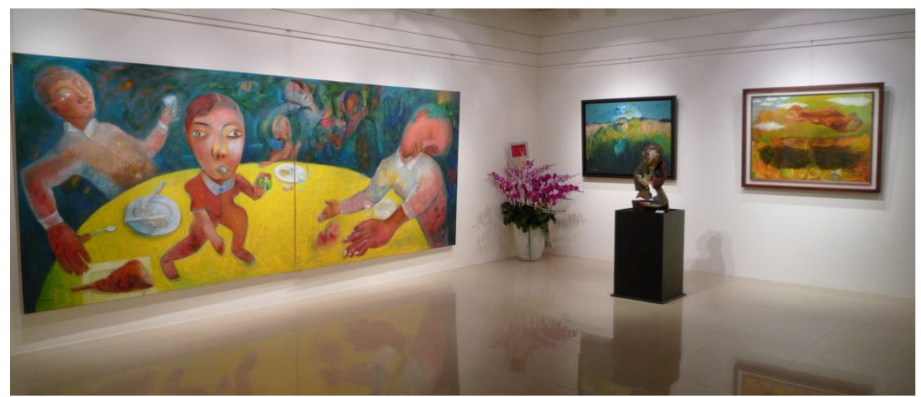
2008年 Alixe Fu 傅慶豊在台北印象畫廊個展