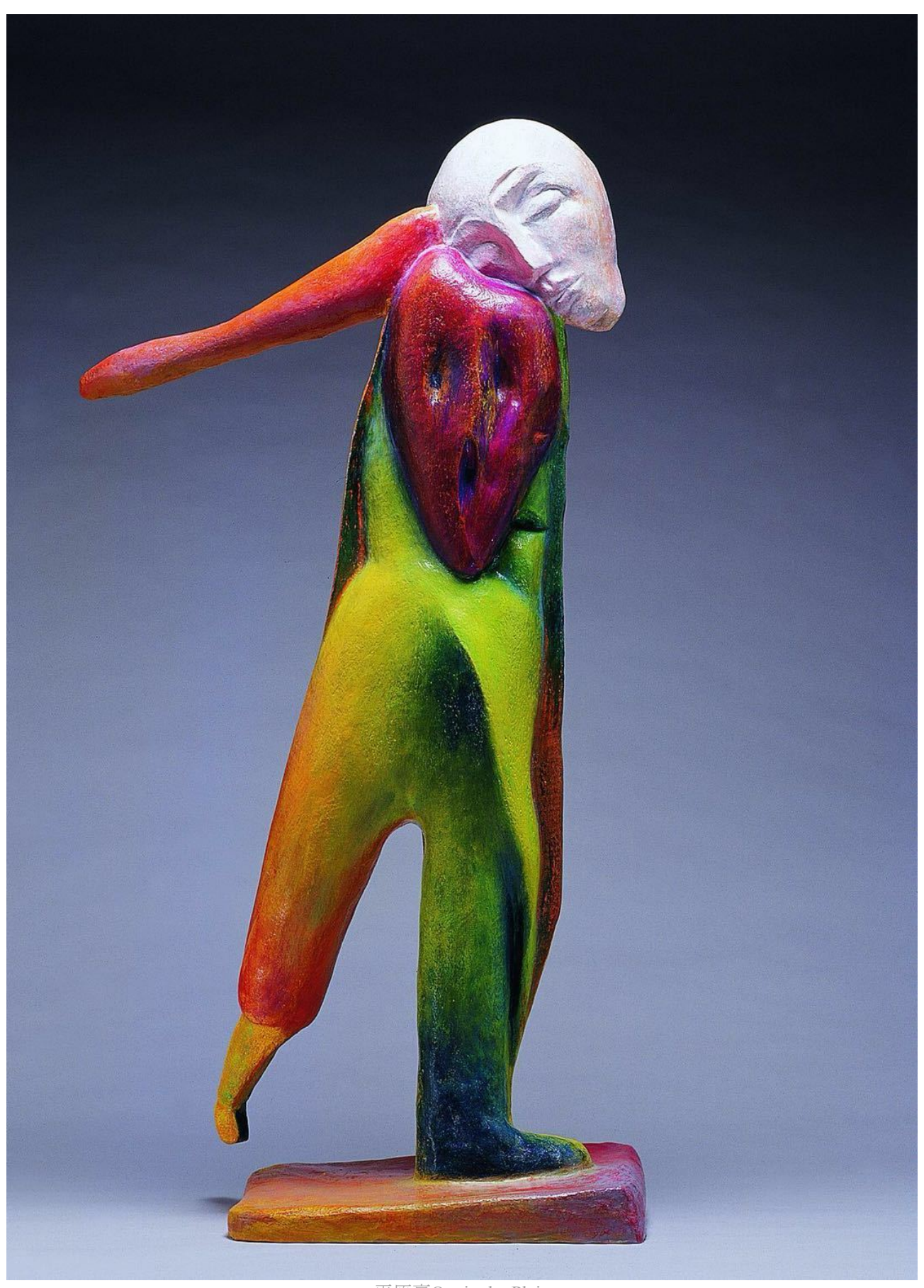
平原裏Out in the Plain 玻璃鋼(F.R.P),丙烯 Fiberglass, Acrylic 91 x 48 x 28 cm (2002)