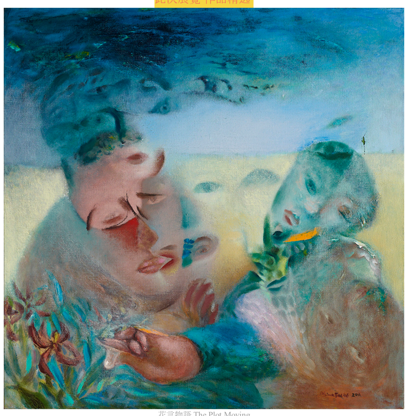
花言物語 The Plot Moving 布面油畫 Oil on Canvas 75 x 75 cm (2006)