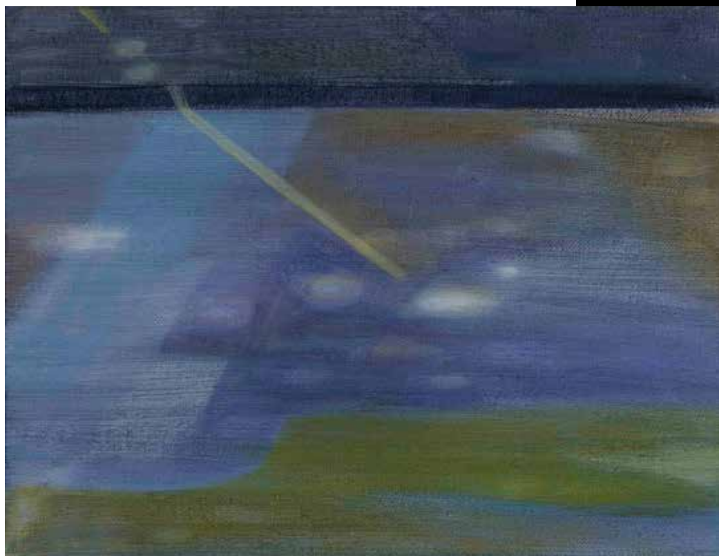
SHADOW No.2 影No.2, 2017 (Oil on canvas 油彩 畫布 - 27x35cm)