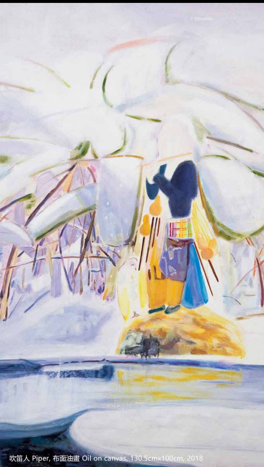
吹笛人 Piper, 布面油畫 Oil on canvas, 130.5cmx100cm, 2018