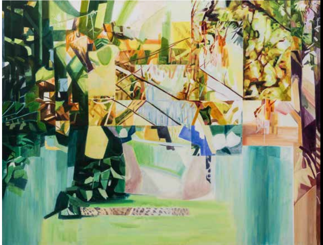
RAINFOREST No.3 雨林No.3, 2018 (Oil on canvas 油彩 畫布 - 100x130cm)