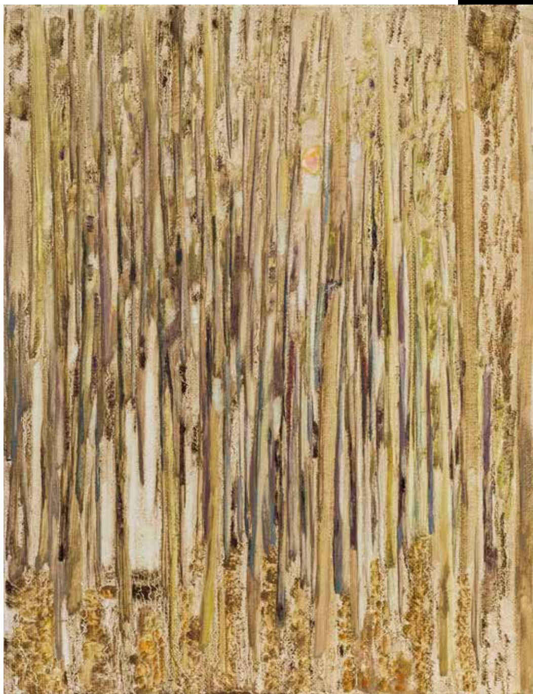
SPRING No.1 泉No.1, 2017 (Oil on canvas 畫布 - 27x35cm)

展覽: 捕風捉影 - 華煒宇個人展覽 地點: 香港中環雲咸街19-27號威信大廈地舖B 開幕: 5月17日5pm-7pm 公眾展期: 5月17日至6月28日