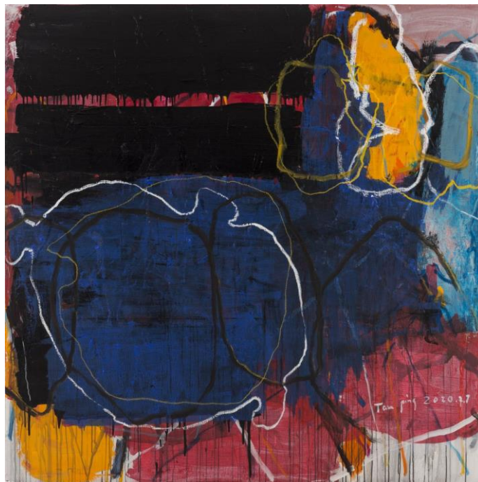
Tan Ping: „Intruder“, 2020, Acryl auf Leinwand, 200 x 200 cm © Tan Ping, Courtesy of the artist

„My work often begins with free, spontaneous line drawing and smudging. At predetermined points in time, I employ a destructive technique to “cover” the artwork, regardless of how perfect the image may appear. Every time I apply this destructive “overlying” method on a seemingly flawless image, I am challenging the limits of my inner self, making the experience of continual “destruction” the very core of my art. On a material level, the overlaid images still exist beneath layers of color, much like human history, where traces and imprints remain despite natural decay or human destruction.“