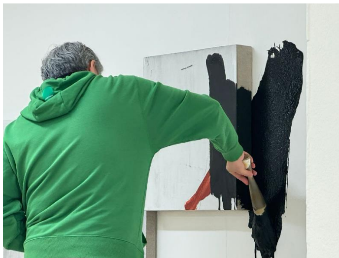
Performance of Tan Ping during the exhibition preparation at the Ludwig Museum Koblenz © Tan Ping, Courtesy of the artist. Photos: Barbara Leers, 2024

Tan Ping was until most recently professor at the Chinese Central Academy of Fine Arts in Beijing (CAFA) and its vice president. His works are collected by major galleries and museums in China and abroad, including Ludwig Forum, Aachen, National Art Museum of China, Beijing, Portland Art Museum